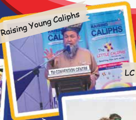
LC Grand Ihtifal